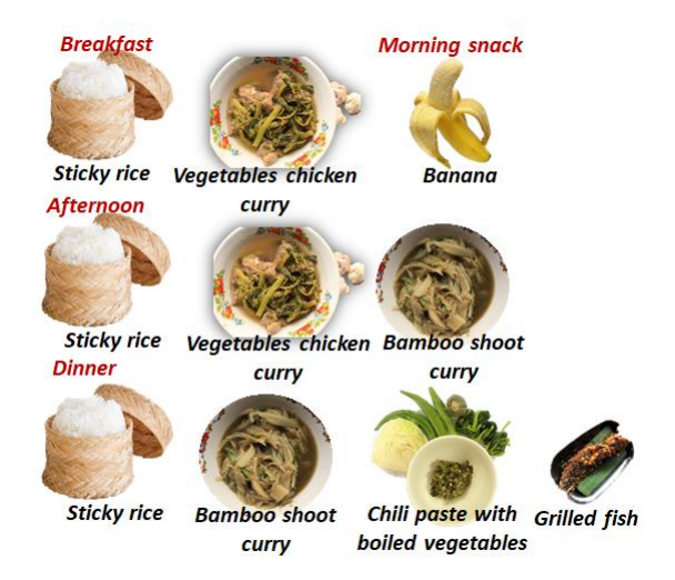
Figure 3. Examples of daily foods (1day)