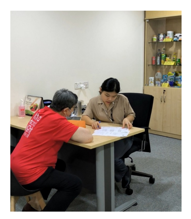
Figure 3: Body composition analysis using a multifrequency body impedance analyser

The activities created the learning opportunity to conduct nutrition screening, manage adult-related NCDs through individual diet consultation, and implement a thematic-based group education project (Figure 4 and Figure 5) for the community in the form of live talks, webinars, or recorded videos (Figure 6 and Figure 7). The free dietetics services by SDC were promoted to increase public awareness through participation in health events and fairs (Figure 8).