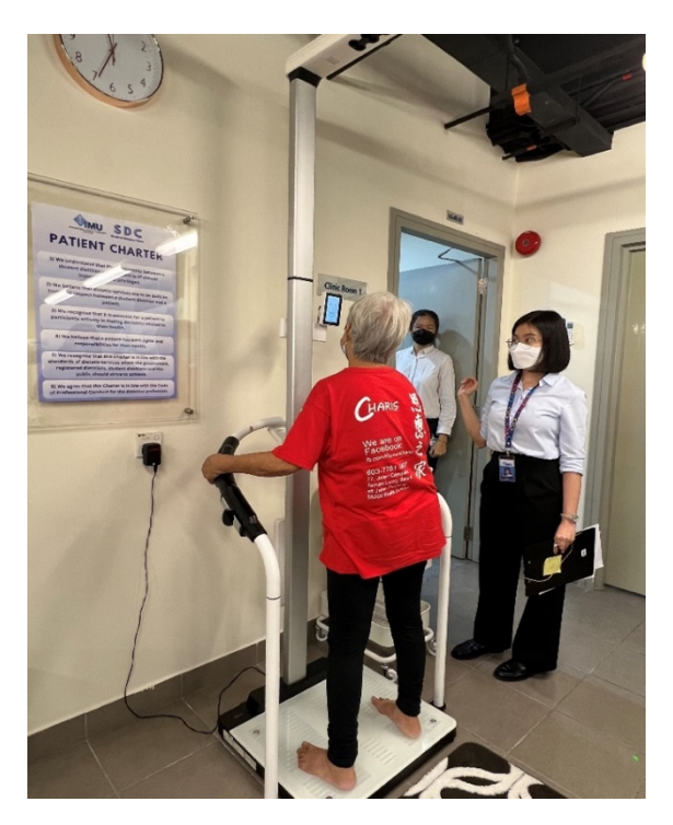
Figure 2: Individual diet consultation by a student dietitian as part of their daily activities

Launched in August 2023, the SDC served as a free clinic and a clinical training site for the final-year dietetics programme, supervised by clinical educators. The Nutrition Care Process was fully implemented in managing patients supported by multi-frequency body impedance analysis (Figure 3), anthropometry kits, real food models, and household measurement tools. Physical copies of patient documentation using ADIME, and medical documents were stored confidentially. Since its inception, a total of 138 patients received individual consultations (Figure 2), and 90 individuals have undergone nutrition screening which mainly consists of students and working professionals in the university. The student dietitians were able to provide medical nutrition therapy primarily for obesity, diabetes, and hyperlipidaemia. All patients seen expressed their satisfaction with the services provided including the quality of nutrition care provided especially on personalised advice and new information acquired, activities conducted, ease of making appointments, minimal waiting times, and overall benefits.