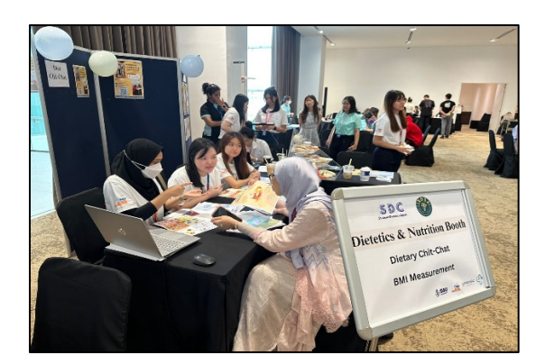
Figure 8: Name