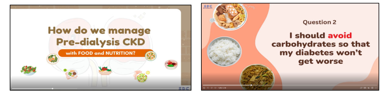
Figure 6: Educational videos on various nutrition-related topics for different target populations