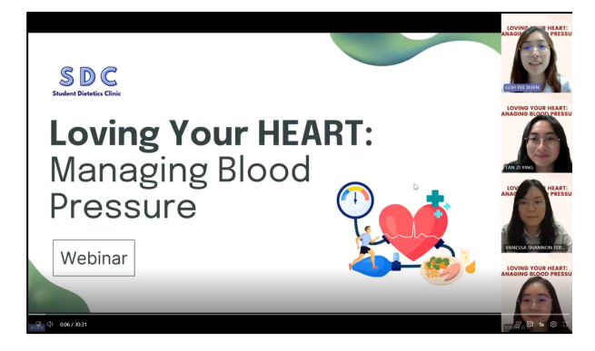
Figure 7: Live webinars to educate on medical nutrition therapy for non-communicable diseases